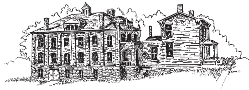
Arts & Cultural Center Scott County Arts Consortium Incorporated